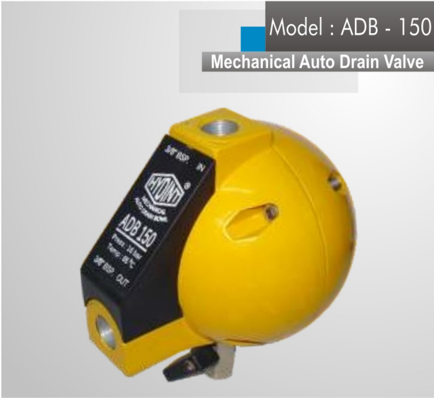
Model : ADB - 150 Mechanical Auto Drain Valve