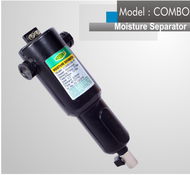
Model : COMBO Moisture Separator